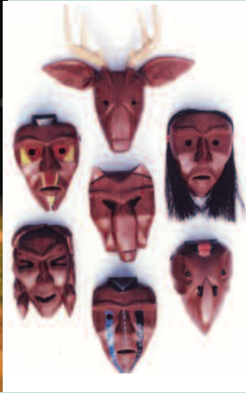
Masks represent the 7 Cherokee Clans