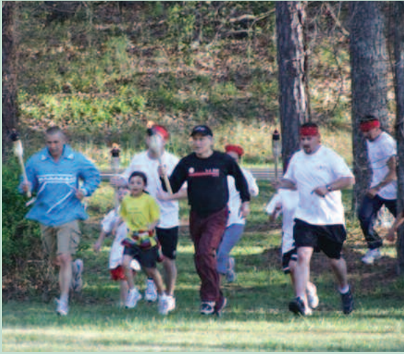
Chief Hicks of the Eastern Band of Cherokee Indians and Chief Smith of the Cherokee Nation returning the eternal flame to Red Clay during the 2009 Joint Cherokee Council.