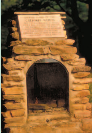
The Eternal Flame of the Cherokee Nations